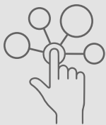
Easy user interface