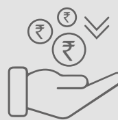
Low cost of ownership